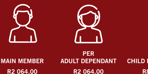
PER CHILD DEPENDANT R814.00